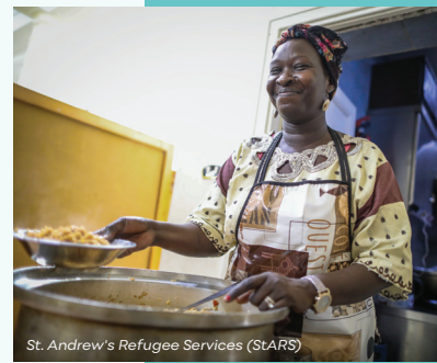
St. Andrew's Refugee Services (StARS)

Every day, agriculture produces an average of 23.7 million tons of food , provides livelihoods for 2.6 billion people , and is the largest source of income and jobs for poor, rural households ... and yet,