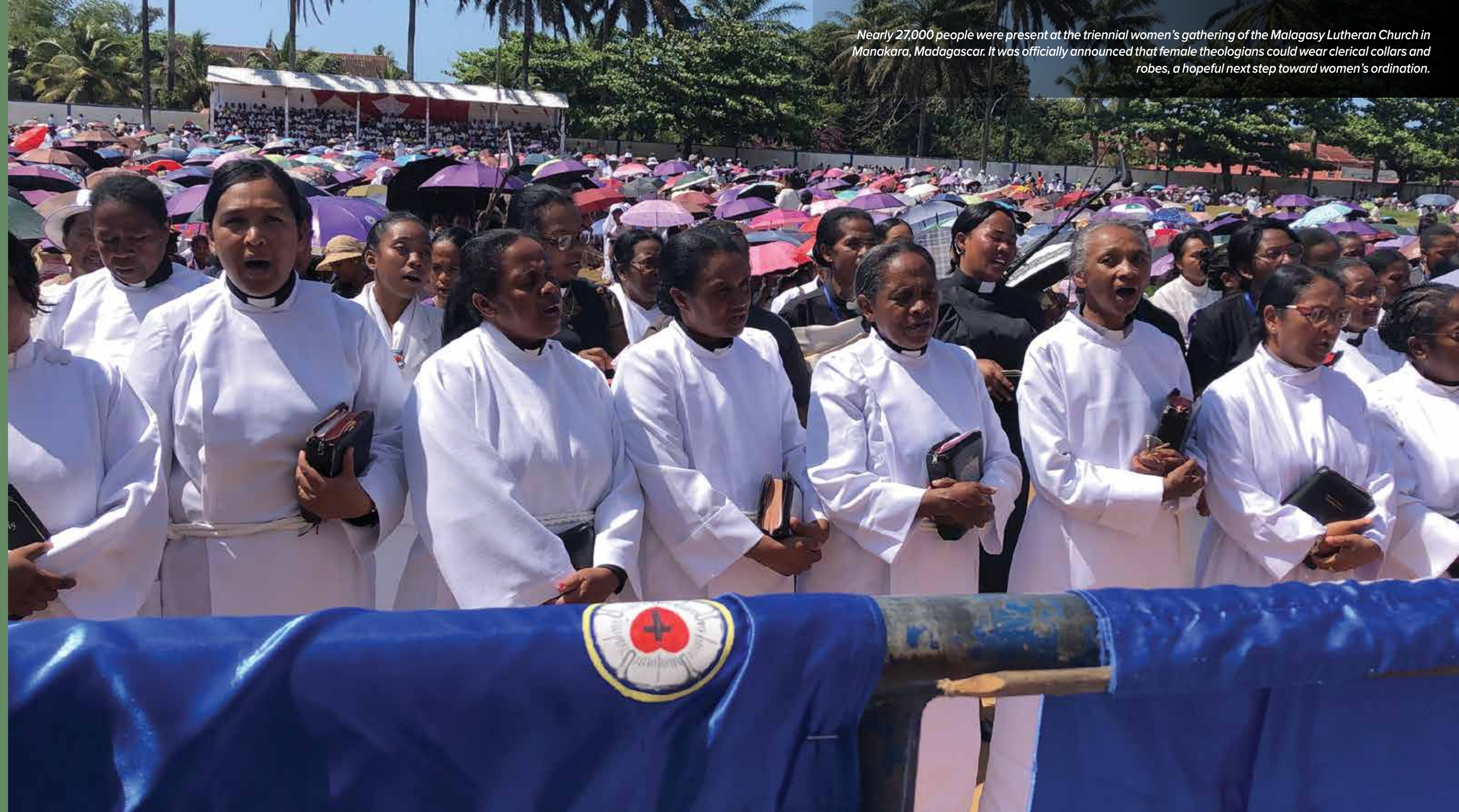
Nearly 27,000 people were present at the triennial women’s gathering of the Malagasy Lutheran Church in Manakara, Madagascar. It was officially announced that female theologians could wear clerical collars and robes, a hopeful next step toward women’s ordination.