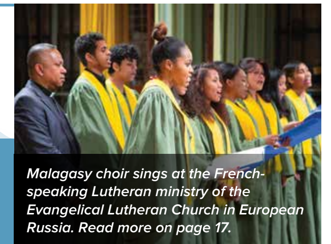
Malagasy choir sings at the French-speaking Lutheran ministry of the Evangelical Lutheran Church in European Russia. Read more on page 17.

REGIONAL EMPHASIS – EUROPE: Accompany and build capacity of minority Lutheran churches reemerging in a postcommunist era for evangelism, mission, and lay and pastoral leadership development. Encourage the exploration of Lutheran identity in context 500 years after the Reformation.