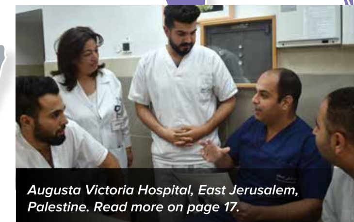
Augusta Victoria Hospital, East Jerusalem, Palestine. Read more on page 17.

REGIONAL EMPHASIS – AFRICA: Strengthen mutual relationships and support programs of companion churches addressing conflict prevention, peace and reconciliation, evangelical outreach, faith formation, food security, sustainable livelihoods and health.