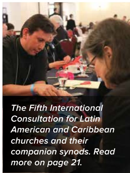
The Fifth International Consultation for Latin American and Caribbean churches and their companion synods. Read more on page 21.

We are called to walk alongside our companions to grow the church and do God's work of restoring and reconciling communities. Thanks to your generosity, the ELCA funds missionaries and projects in more than 90 countries. Learn more at ELCA.org/globalmission.