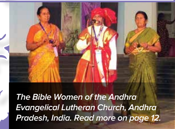
The Bible Women of the Andhra Evangelical Lutheran Church, Andhra Pradesh, India. Read more on page 12.

Accompany churches as they renew their Lutheran identity and meet challenges of religious plurality in today's context. Increase the capacity of churches and development organizations to address critical issues of sustainable development and justice.