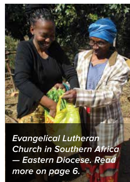
Evangelical Lutheran Church in Southern Africa – Eastern Diocese. Read more on page 6.

Accompany churches as they do mission, explore new ministry models, train leaders, strengthen their Lutheran identity, defend human rights and promote economic, gender and climate justice. Seek just and humane treatment of migrants through the work of our AMMPARO (Accompanying Migrant Minors with Protection, Advocacy, Representation and Opportunities) companions in the region.