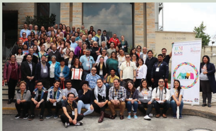
Attendees of the “Ayni” event in Bogotá, Colombia.