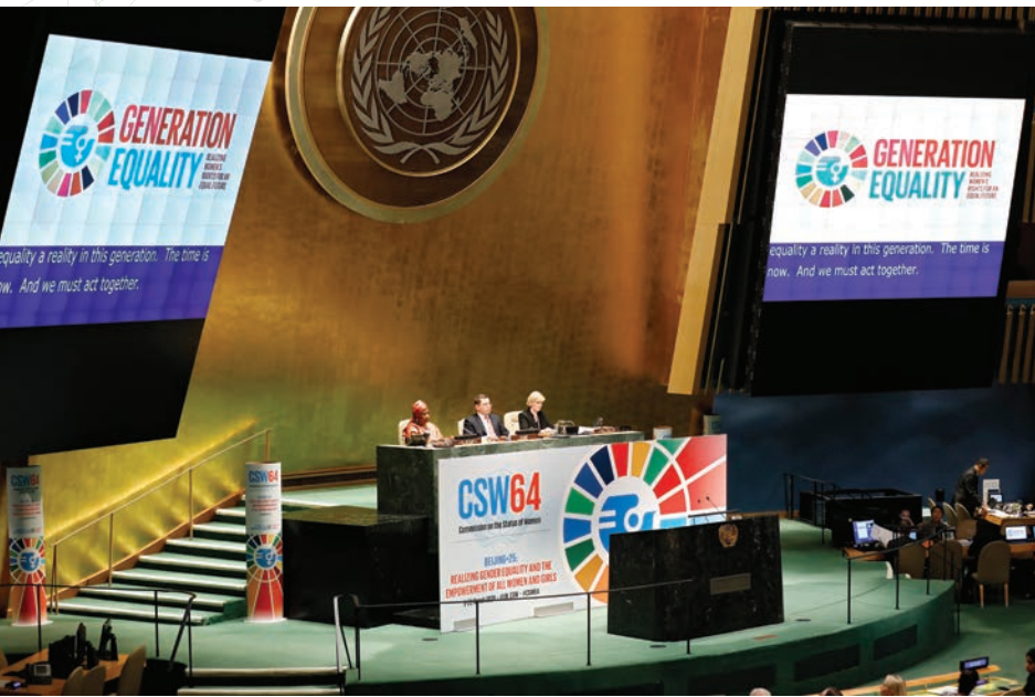
The 64th session of the Commission on the Status of Women.