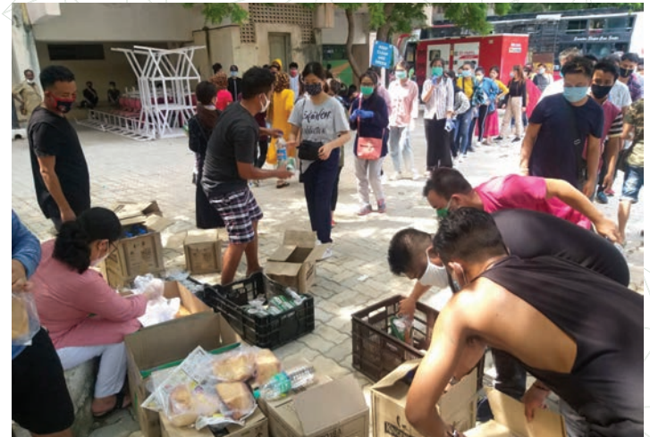
Using its own resources, the UELCI has begun modeling care for migrant workers in places where they are “stuck,” in this instance at a major train station.

The people of Konsaigaon, in particular, have always had to walk far from their homes to get water. Many are day laborers with limited time for this. They are often