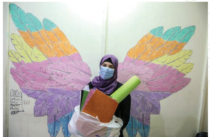
A woman receives her psychoeducational package from Groups and Activities Programs.