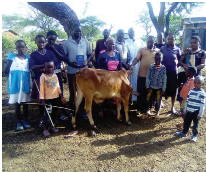
After sharing the word on May 31 at a boma in Ngatu, Kenya, a family gives a calf as an offering to the church.

On March 15, two days after Kenya detected its first case of COVID-19, Ngatu Lutheran Church was ordered to stop holding services. Soon afterward, church leaders in Ngatu got together to plan. What they came up with – the way they've defined "church" – has increased congregational vitality, created space for dialogue, reached the unchurched and more than doubled weekly giving.