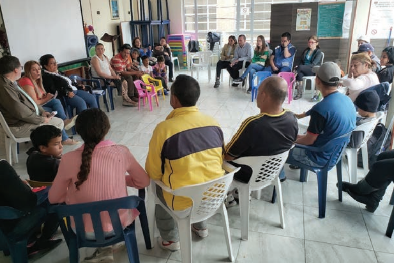
Discussion of the participants in the south to south exchange.