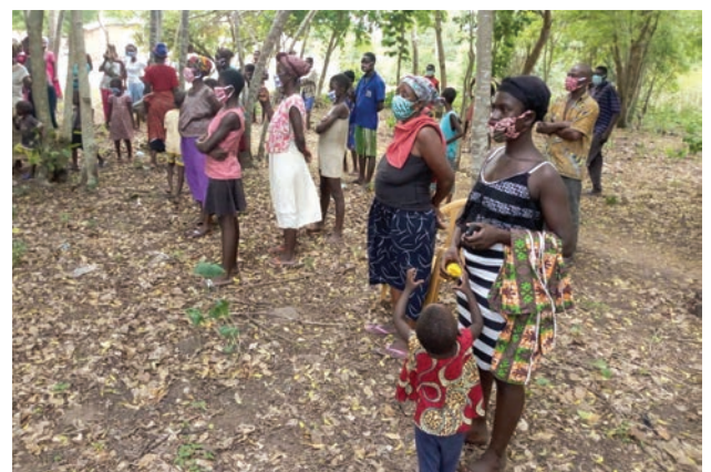
This skills development project by Good News Theological Seminary serves Ziope-Wudzedeke communities in the Volta region of Ghana. The project is supported by ELCA World Hunger and Lutheran Disaster Response.