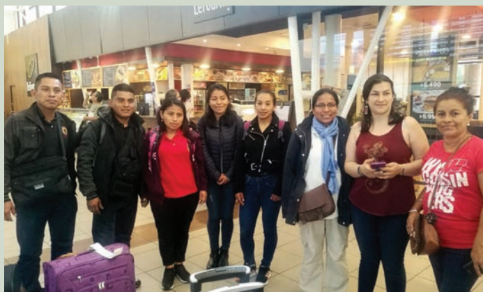
Leaders from the South and Central America Lutheran churches.

In February, the Latin America and Caribbean Desk of Global Mission and Latino Ministries of Domestic Mission celebrated the first Interamerican Lutheran Conference in Bogotá, Colombia. The name of the event was “Ayni,” a Quechua word that means reciprocity and mutuality in the relationships among people and communities. The purpose was to provide an opportunity for Spanish-speaking communities in the continent to meet, connect, share best practices and collaborate in the areas of congregational vitality and sustainability, ministry among Indigenous communities, youth work, migration and theological education. Over a hundred participants gathered, representing the Lutheran churches of the Latin American and Caribbean region and the ELCA’s Latino congregations, Native American communities and seminaries.