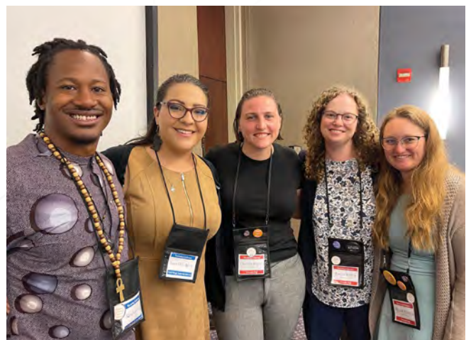
Several alums of the ELCA Hunger Advocacy Fellowship joined Service and Justice staff at the Becoming Conference, leading the ELCA World Hunger panel “Faith in Action: On and Off the Clock.”