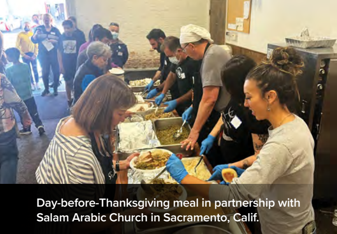
Day-before-Thanksgiving meal in partnership with Salam Arabic Church in Sacramento, Calif.

This year Arab and Middle Eastern Ministries is looking forward to partnering with ELCA World Hunger to start an online Christian radio station for Arabs. Through this partnership the team hopes to reach and engage different groups in the community, including the most vulnerable. Expanding members' religious and spiritual knowledge, interest and commitment will change their behavior and sustain their spreading of God's Scriptures. They will be better able to grasp Christian and humanitarian values and pass them on to different generations, continuing the effort to align the Arab and Middle Eastern Desk's strategy with the ELCA's