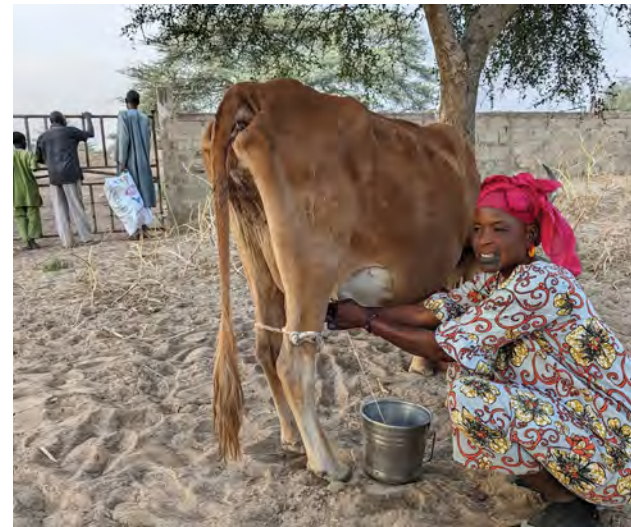
More milk means more money, nutrition, options and ultimately dignity for families in Senegal.