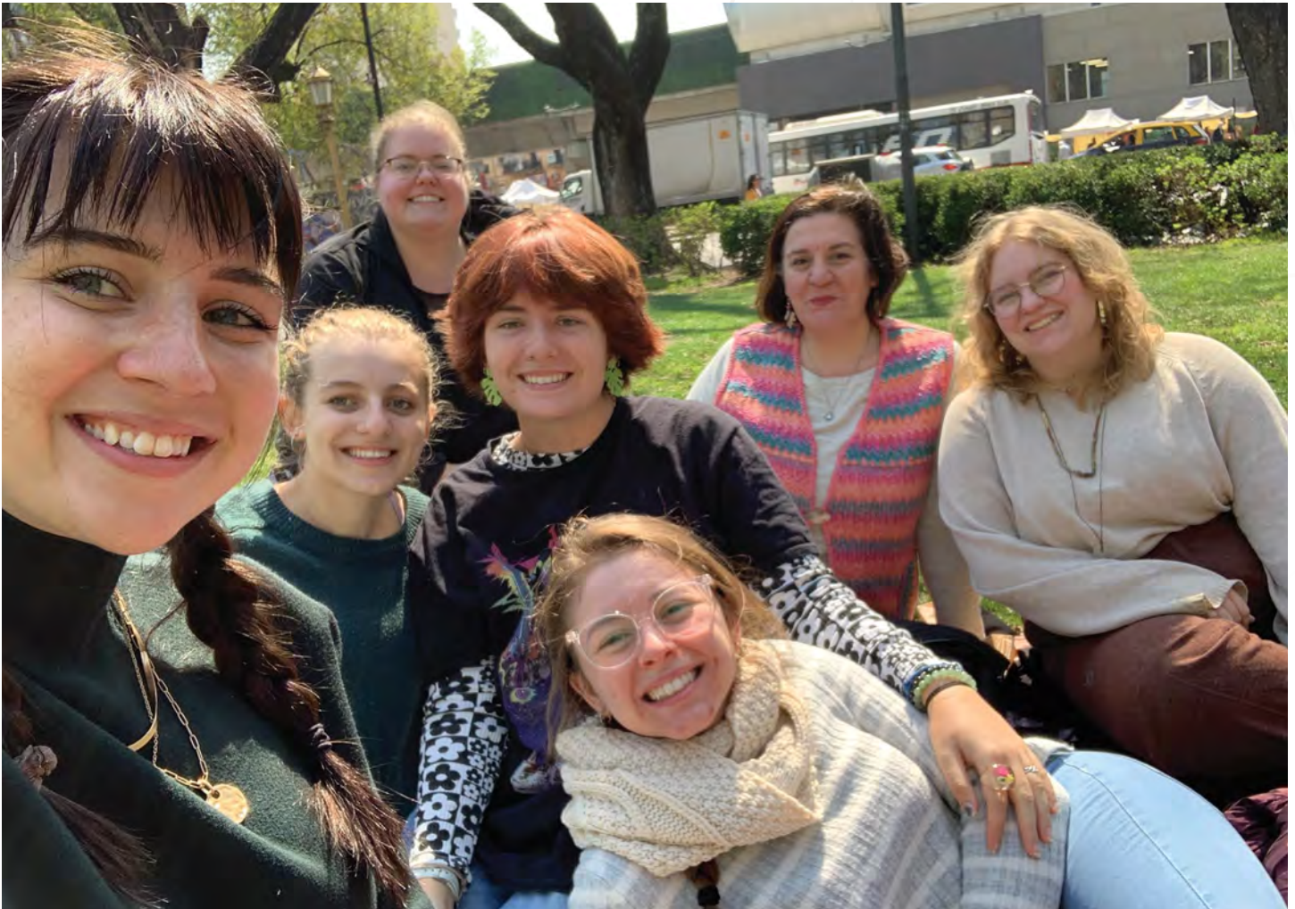
The Young Adults in Global Mission (YAGM) Argentina group

Young Adults in Global Mission was successfully relaunched in 2022. In this season, when COVID still looms, YAGM is grateful for the experiences and stories of the 24 young adults who answered the call to serve in one of its four country programs: Argentina/Uruguay, Jerusalem and the West Bank, Senegal, and the United Kingdom. The YAGM team spent its time during the pause building out COVID protocols, reviewing and restructuring program sessions and recruitment practices, and working to make YAGM accessible to any young adult seeking a year of service and accompaniment.