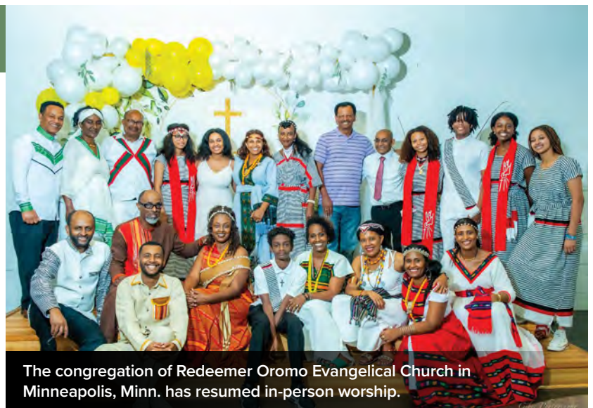
The congregation of Redeemer Oromo Evangelical Church in Minneapolis, Minn. has resumed in-person worship.

The second International African Lutheran Conference, hosted by the Lutheran Church in Liberia, will be held April 20-30 in Monrovia, Liberia, under the theme “Preach (Gospel), Teach (Formal Education) and Heal (Wholistic Healing Approach: Spirit, Soul, Body).”