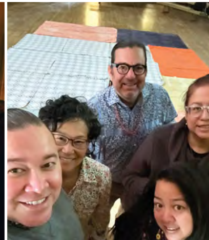
Indigenous leaders tour Chicano Park (left) and tell their stories (center) at the Indigenous Leaders Gathering in San Diego, Calif.